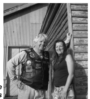
Fig 2. Display a picture 'emanating' good memories

Manifest your intent - in Feng Shui we know that the power of your thought creates a consciousness. While making your bed each morning, visualise how sensual you wish this day to be. Enjoy!